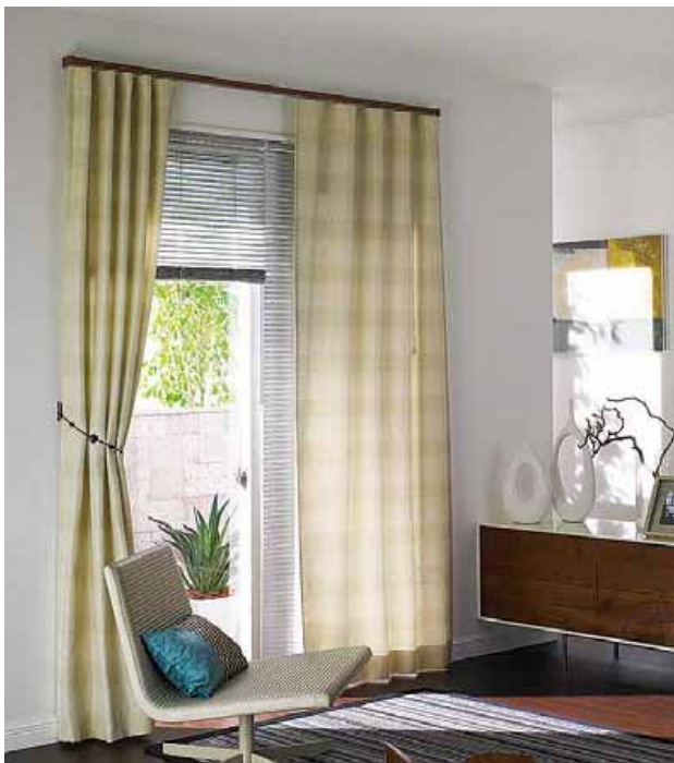
“TACHIKAWA CURTAIN ROD WOOD TONE V-24” installed at the front of the room

This product line, which has been shaped into a spiffy form, brings a simple and refreshing mood in the space around windows, and is available in the same painted colors as the Rod Wood Tone V-24 series. A couple of these tracks are also usable for pairs of drape (thick-cloth) and lace curtains.