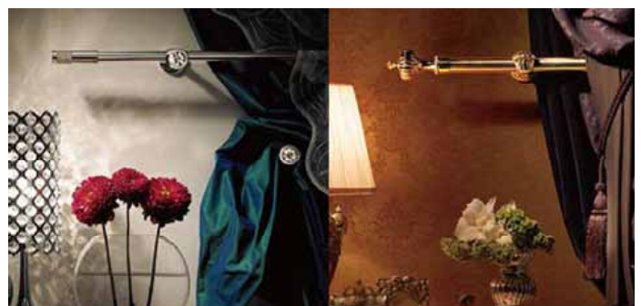
“TACHIKAWA CURTAIN ROD BRASS”